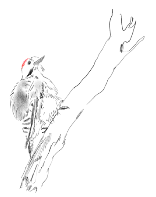
unfortunately time for goodbyes...